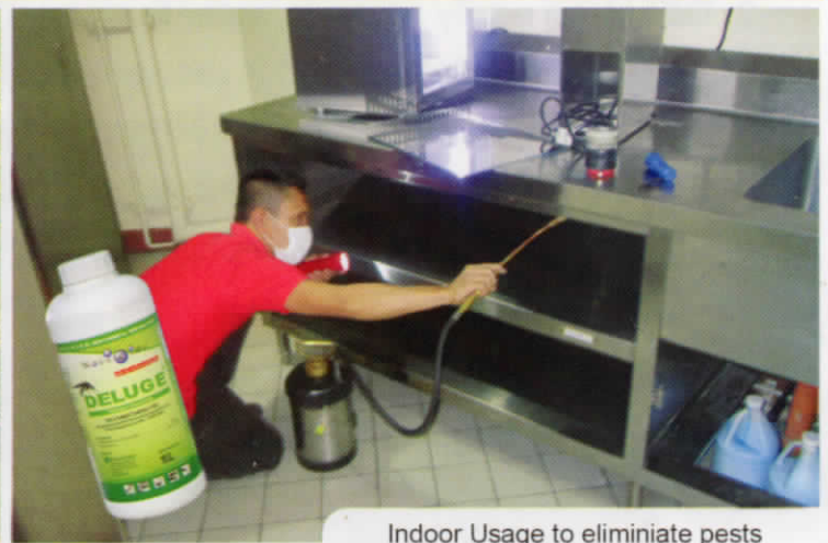
Indoor Usage to eliminate pests