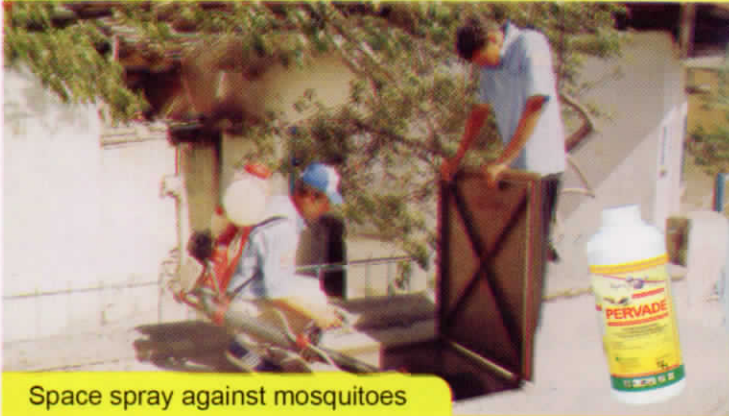
Space spray against mosquitoes

Permethrin in PERVADE is a Type I synthetic pyrethroid and the target site of action is the nervous system. When exposed to PERVADE , insects experience hyper excitation & tremors in its nerves, which is eventually followed by convulsions, paralysis and death when lethal dose is reached.