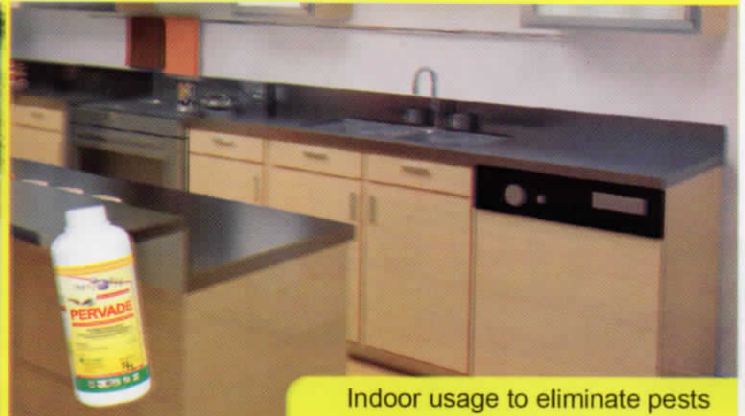
Indoor usage to eliminate pests